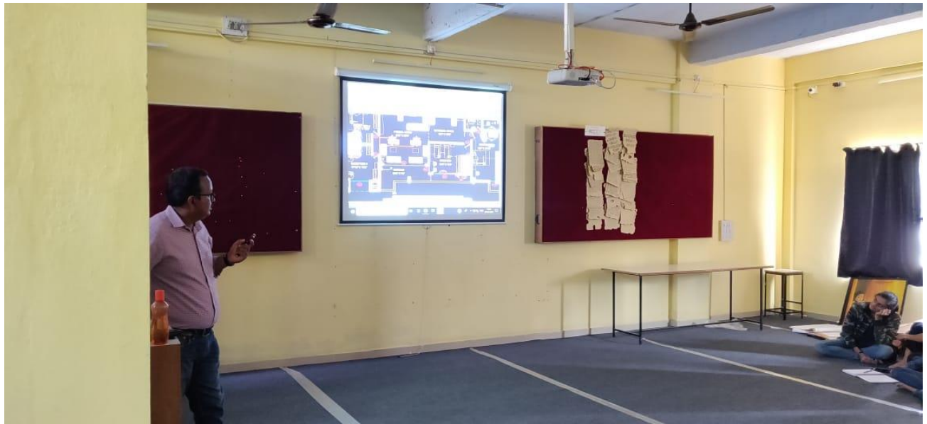
Eng. Sandip Hukkeri. While explaining layout of HVAC on PPT